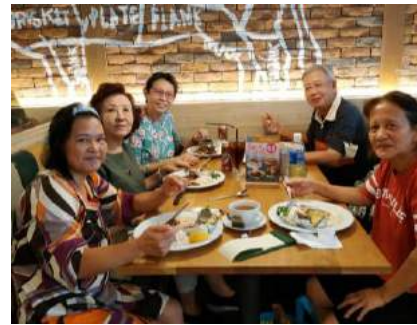
Christmas cum Thanksgiving Celebration