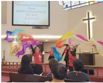
“Blessed By Your Name” Sisters’ Fellowship Retreat @ BLC 27 April 2019