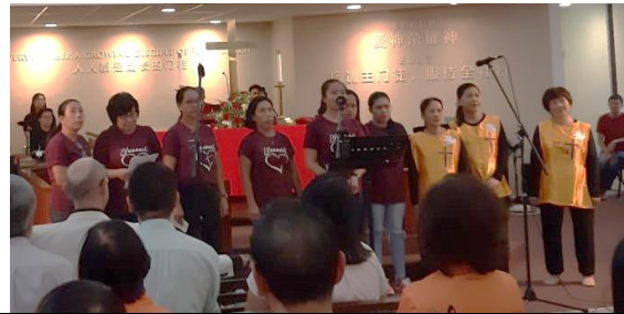
October 27, Reformation Sunday @ QLC