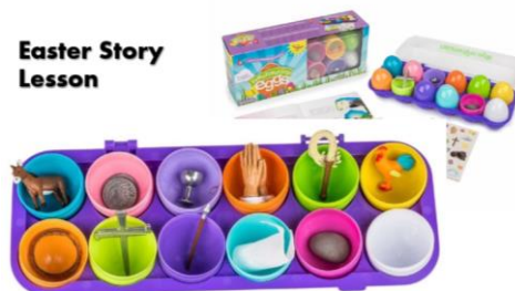
And Other Fun Hunts