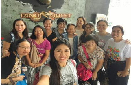
18 August - DinoQuest n OmniTheatre