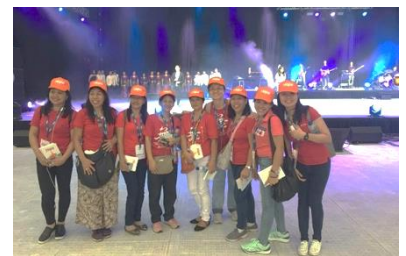
19 May – Celebration of Hope