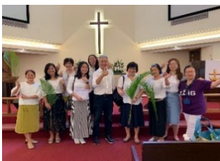
14 April-Song Presentation