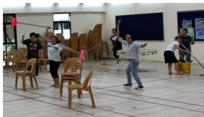
5 May-LOVE BLC, Spring Cleaning