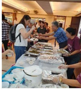
13 October – 40 th Anniversary Mission Month – Pinoy Food Booth