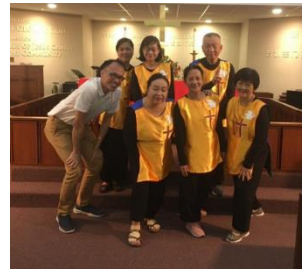
“You said” Reformation Sunday @ QLC 27 October 2019